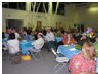
Everyone having a good time