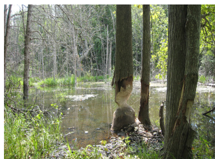
Evidence of beaver residents next to the jump