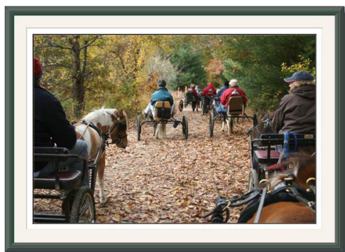
The bikers, run- View from the cart while going down the trails

ners and walkers we met along the way were thrilled to see our parade of minis go by, many of whom wanted to pat and talk to us about our little ones. Almost 3 hours later we emerged from the woods and back to the trailers but not before a lot of pictures were taken!