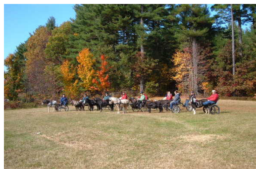
Miniature horses lined up hitched and ready to go!