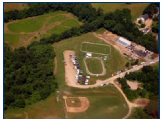
Pipestave Hill aerial

Ever wonder where the name "Pipestave Hill" came from? In the 1600's Pipestave Hill was covered with birch and oak trees from which were cut staves for making pipes, large wine casks holding 126 gallons, and hogsheads, barrels for molasses holding 62 gallons. From this industry the hill derived its name.